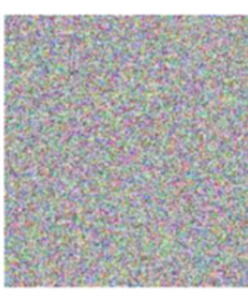
User on Zoom's AES ECB